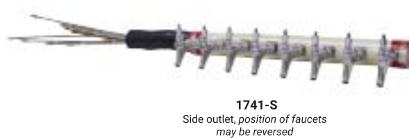
1741-S Side outlet, position of faucets may be reversed