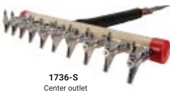
1736-S Center outlet